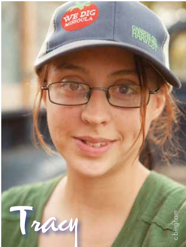
YOUTH FARM CREW LEADER

A "For some reason, when I tell my friends about the Youth Farm, I feel kind of proud because learning how to be a farmer, growing food for CSA members and Mobile Market, and everything at the farm is awesome."