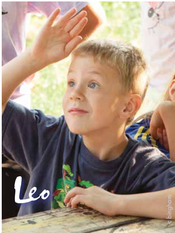
LITTLE PEAS CAMPER