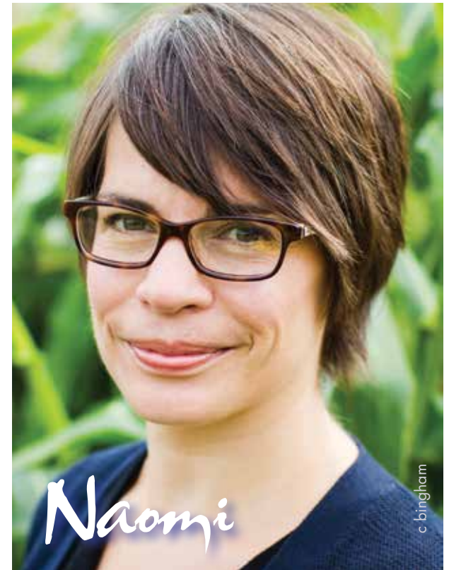
NORTHSIDE COMMUNITY GARDENER

A "As a result of our first harvest season, we filled our cupboards, refrigerator and freezer from our garden and even as we approach a new planting season, we still have some bags of green beans from that second planting I was sure would never grow. We no longer rely on the food bank to get us through the month and things are looking up for us. The Northside Community Garden has been a source of food for us but it's also been a source of hope and renewal and we're grateful to be a part of it."