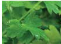
Farm to School